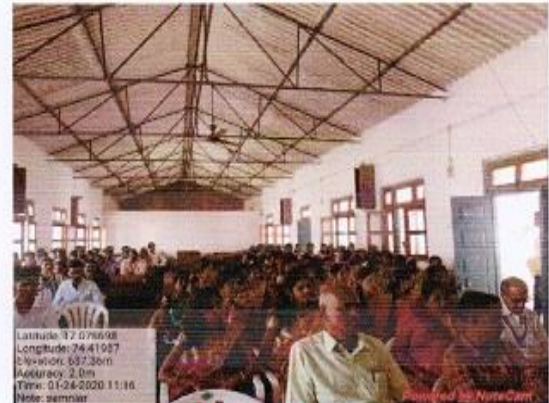
Participants of the Seminar