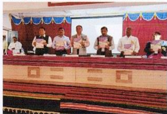
Publication of Seminar Proceeding