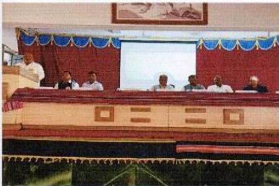
Addressed by Hon. J. K. (Bapu) Jadhav